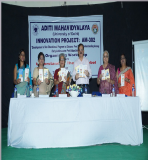
Workshop on Understanding the Food Label