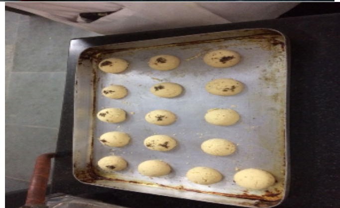
MULTI MILLET BISCUITS