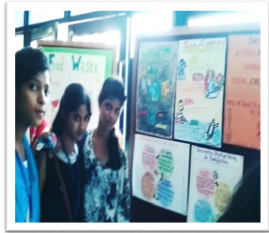
Participation in World food day