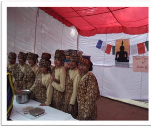
Participation in North east festival