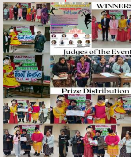
25th January 2023