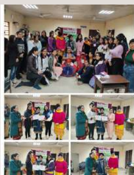
25th January 2023