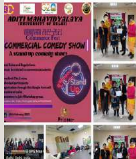
24th January 2023