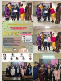
25th January 2023