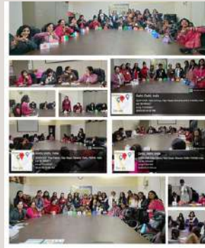
24th January 2023

Here, the participants represented 12 different Countries and questions were asked by the judges of the event about G-20 SUMMIT. Twelve students participated in this event. This event has been incorporated in line with the Global G-20 Summit which the Nation is proud to host this year. There were 12 participants from various departments of B.A. (H) Geography, B.A. (Prog.) etc. along with the students of Commerce. Each participant represented a participating nation of the Global Summit and presented their views on