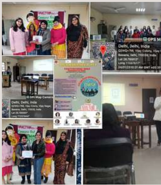
24th January 2023