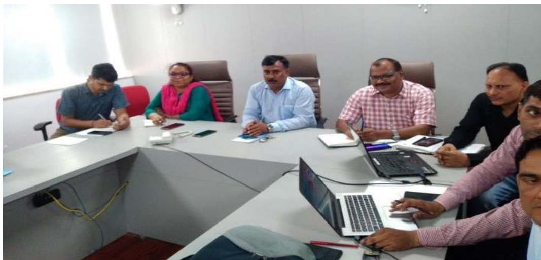
Uttar Pradesh Evaluation Debriefing meeting and UPSACS office

The Debriefing meeting was conducted to give evaluation results to NGOs. It is an important event when the program head of the TI/LWS NGO and SACS officials listen to evaluators' observations and suggestions for the evaluated NGOs. Total 222 TI/LWS projects have been evaluated in this timeframe.