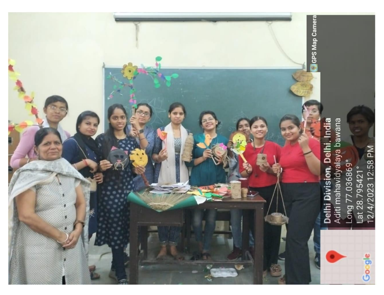
Page 3 of 7