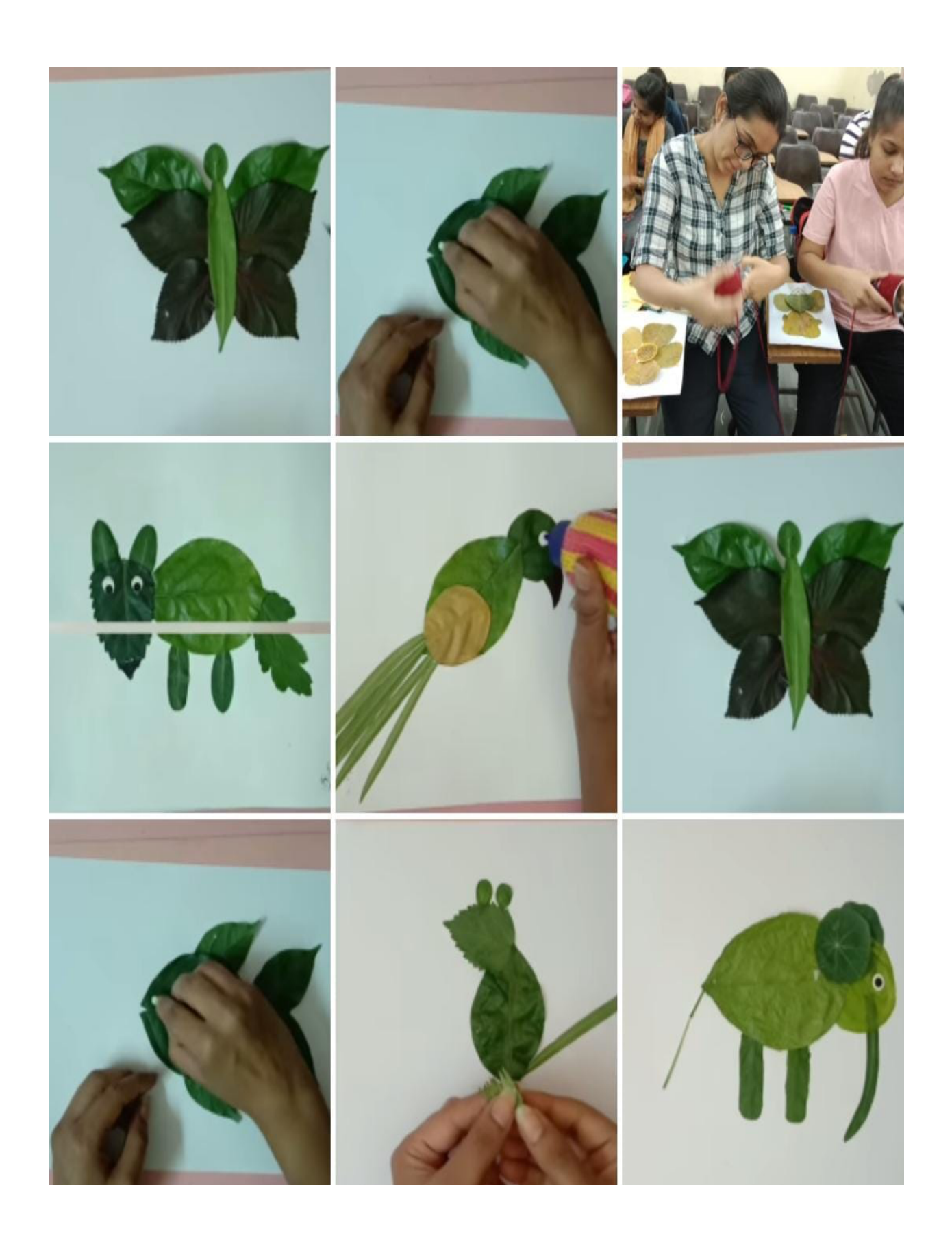
Page 6 of 7